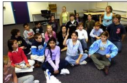
They may look like students at the Covington School, but actually there are three Jennifer Granholms, a couple of Dick DeVoses and a few Joe Knollenbergs sitting on the floor. The kids adopted those roles to learn about the election process.