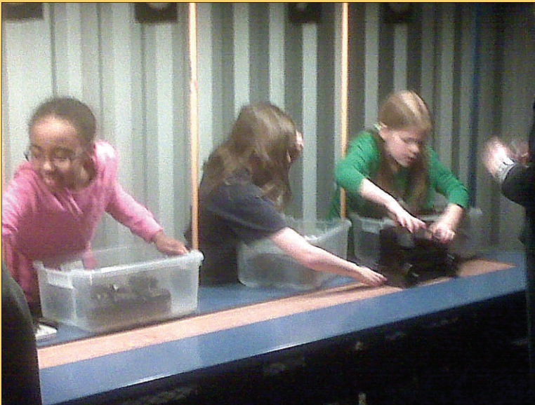
Model T assembly line